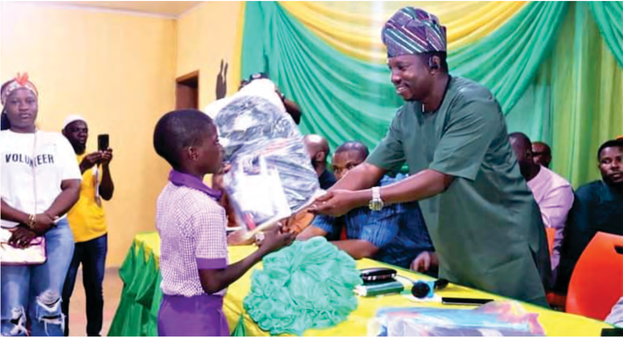
Hon. Rasaki Kasali awarding student a "Back-to-school" package

towards improving the standard of the education system in the council. He said that there are various challenges confronting the education system of the council and the council has taken it upon itself to revitalize necessities in that aspect. He urged capable philanthropists to also support and complement the council towards mitigating the challenges. Kasali promised to continue to collaborate with credible NGOs as their activities can complement the vision of his administration.