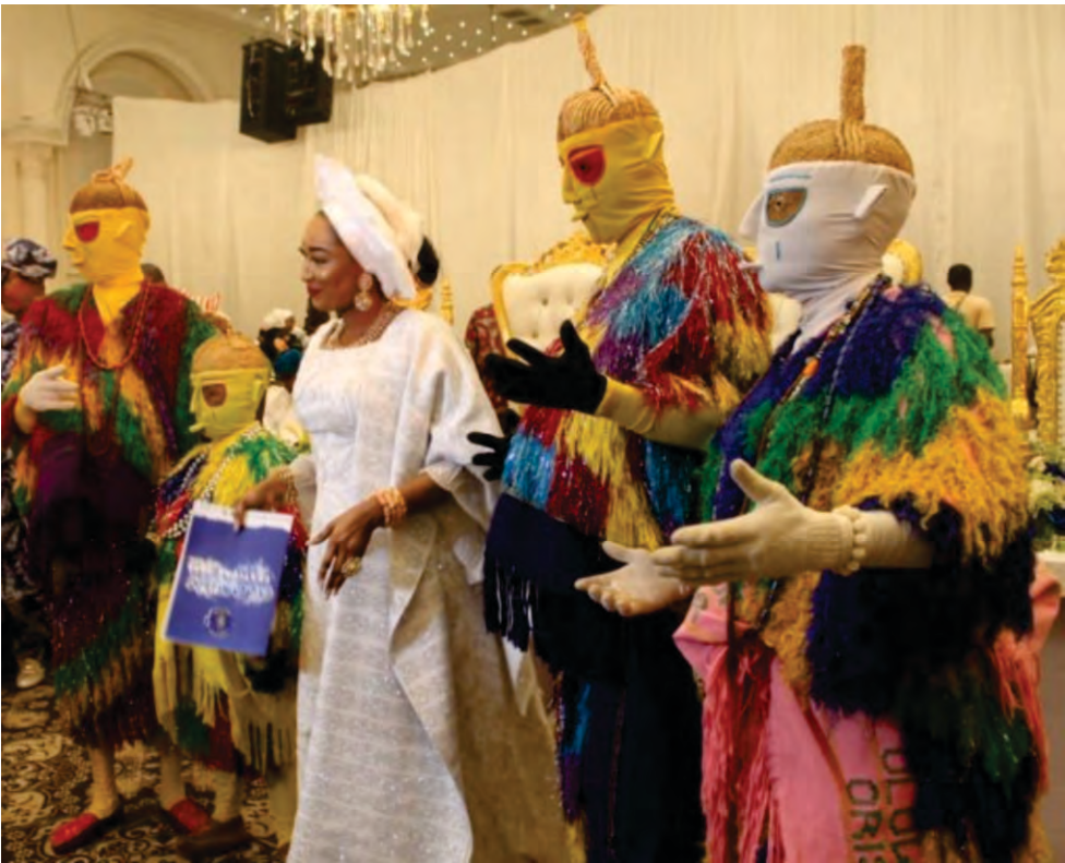
Picture showing the cultural heritage