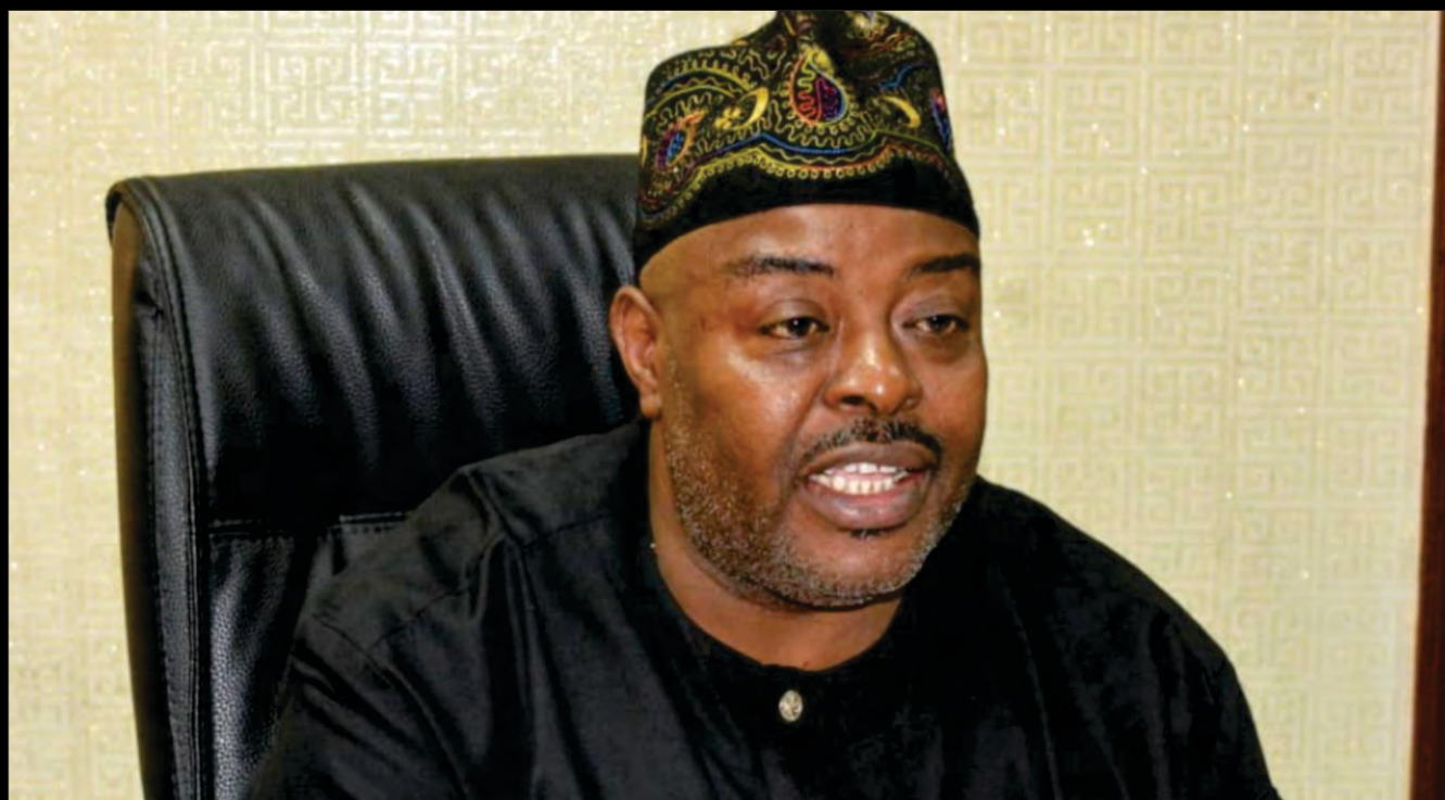
Hon. Wahab Alawiye-King

FG launches poverty eradication programme in Lagos PG.14