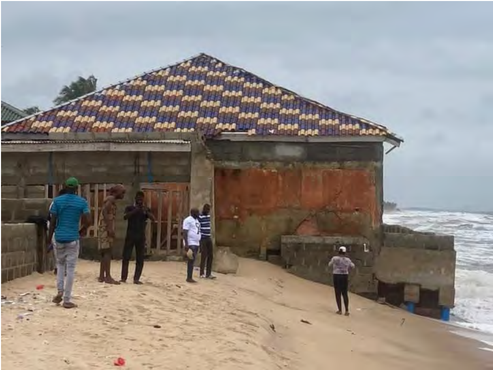
Picture of Otunba building at Eleko beach