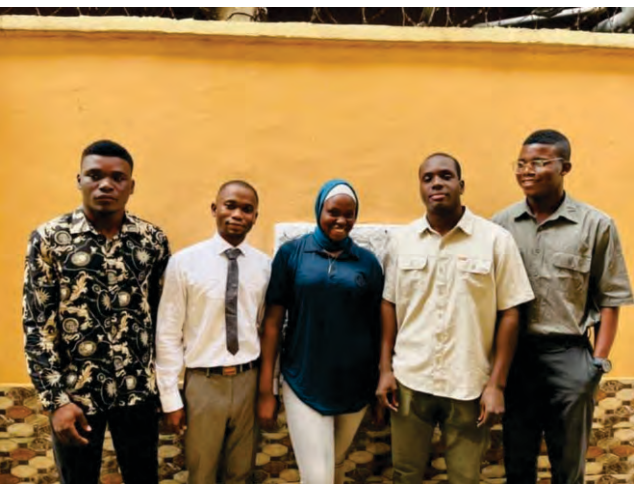
Picture of LASU representatives at 2022 annual Millennium Ocean competition