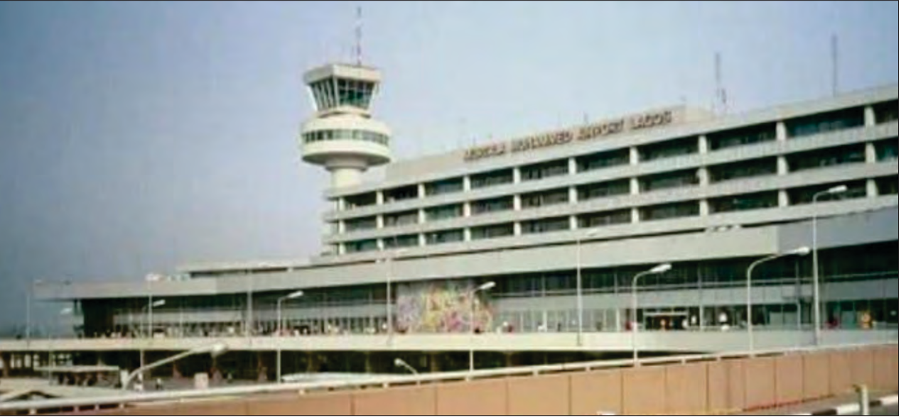
Lagos International Airport

"The Terminal Two project started in 2013 and was completed by the present administration in 2022 under a bilateral agreement with the People's Republic of China." He further revealed that the new facility had generated over 10,000 chances for direct and indirect employment.