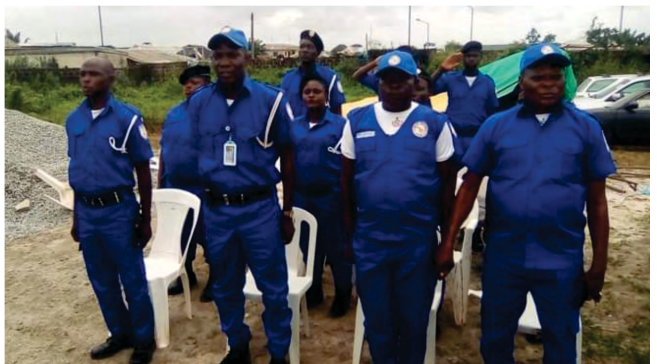
The new security outfit

Immediately after the vote of thanks, the event-train shifted to the new office of the body in Odomola; as all the local security outfits present staged a beautiful parade at the office located along the Epe - Ibeju- Ode Expressway.